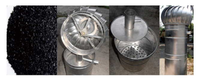
Figure 1. Active Carbon and Cyclone Ventilator Modification

The material used was a 105 μm of active carbon from coconut shells (obtained from 140-sized mesh), while the cyclone ventilator modification consisted of the following components: 1) the cyclone/turbine ventilator, 2) the activated carbon reactor. The specifications of the air-chamber device (cyclone/turbine ventilator) and the active carbon reactor were as follows: 1)material: alluminium; 2) diameter: 45cm=16"; 3) Dimensions: 75 x 68 x 68 cm (HxLxW); 4) Weight: 4.5 kg to 8.5 kg; 5) Suction Capacity: 42.39 m³/min; and last 6) the media thickness: 20 cm.