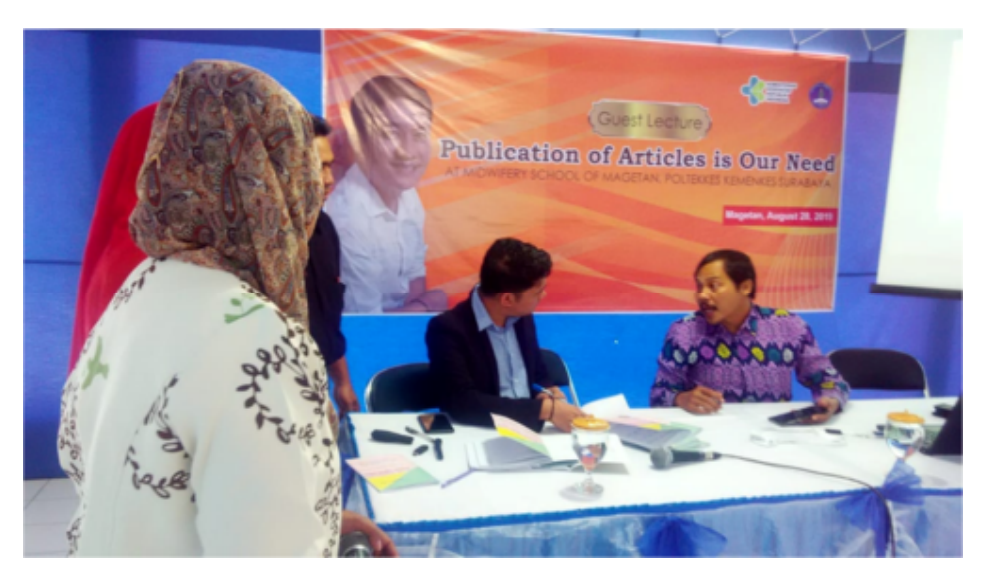
Figure 2. Guest lecture activities in Indonesia